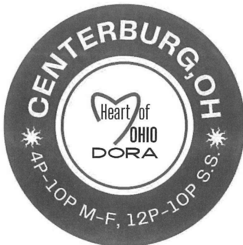
Participating Liquor Establishment Decal