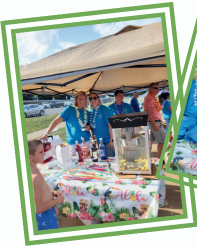
Knox County Community Health Center celebrated National Health Center Week with a free pool party at Hiawatha Water Park in August 2023.