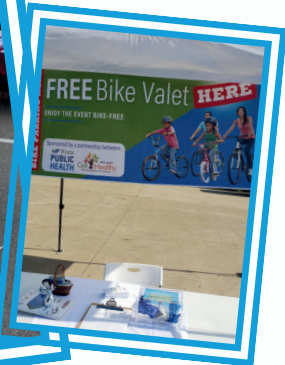
First Friday is a staple event for outreach. KPH provides a Free Bike Valet and engaging activities to educate the community on important health topics.