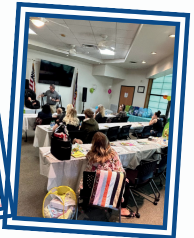
Families attending the annual WIC Baby Shower receive education on Sleep Safety and Car Seat Safety.