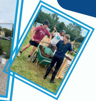
Creating Healthy Communities partnered with the Knox County Local Food Council to offer an eight-week youth development garden program. Teens learned various skills, including gardening, cooking, nutrition basics, banking basics and budgeting.