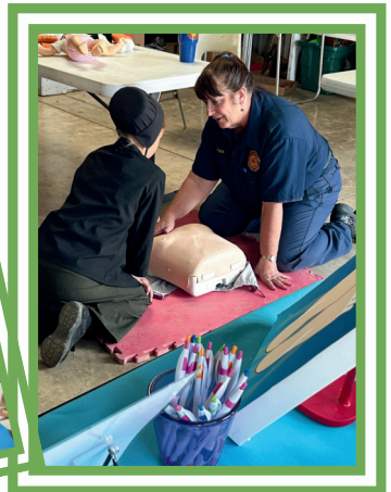
Knox Public Health coordinated Danville's Amish Health and Safety Evening in May 2023.